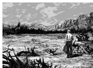
Picture1. Blasted Heath

This moment of scenery can also be used to describing a nuclear bomb that exploded. “No watcher can ever forget that sight” really implementing a scenery of wonder that human is a frail, weak, and hopeless creature that will die to anything stronger than them, and there are a lot of things from outside or inside the space that could kill or destroy one’s mind.