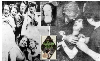
Picture1. Radium Girl

In 1920s, precisely a few years after World War I, there is a group of women who worked on Radium dial factory where they have been contained with Radium which is a luminous substance that can be mixed with paint to make the paint more beautiful and could glow in the dark.