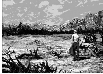
Picture2. Blasted Heath

In the story, you can see various living things happened to be in constant changing after the meteor hit the farm. It started from the plants, animals, waters, until humans, like what was described in the narration with