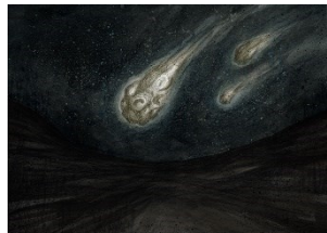
Picture6. The Meteor

Nuclear weapon is one of the most dangerous weapon on earth, with only one unit of the weapon can exterminating a whole city, killing even millions, ruining the natural environment and future generations because of the long term catastrophic effects. These doomsday weapons will not only destroying the unlucky nature, but also making it unlivable place because of the radiation. The blast from the bomb will release a thermal radiation which can burn not only skin, but also the majority of the area itself. While the explosion can have such a range even in miles square, the after effect of the weapon can be devastating for many lifeforms. Human body cannot hold that much of a radiation and will creating cancer inside their body, in a count of few days, the cancer could kill even the healthiest individual.